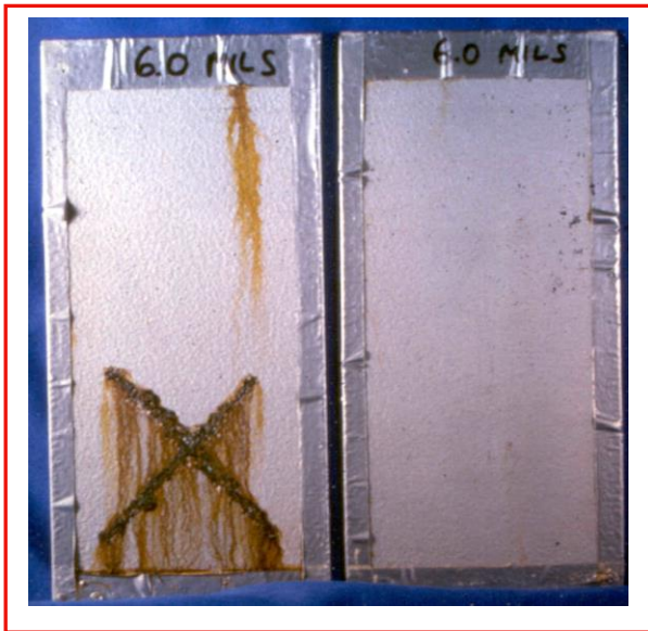
ASTM Salt Fog Test: After 2500 hours, U-104 applied over pre-rusted panels, L panel scribed, no surface prep.

U-104 has been proven effective in numerous lab tests, including 14,000 hours in a salt fog chamber demonstrating virtually no rust creep under the coating where scribed. More importantly, it has performed in the field, resisting corrosion on bridges, water tanks, roofs and other steel structures showing no need for recoat for two or more decades.